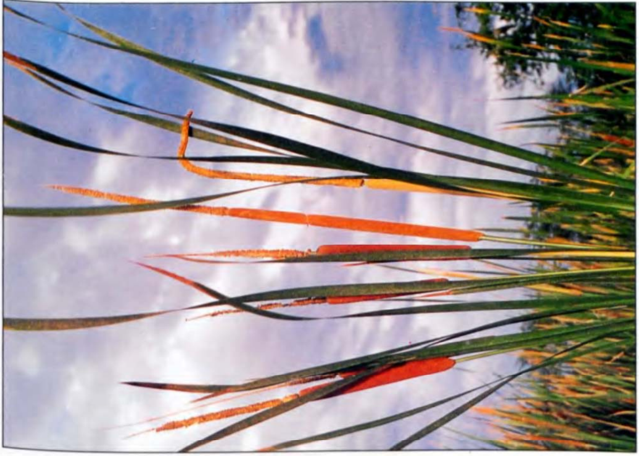
Typha angustifolia L.