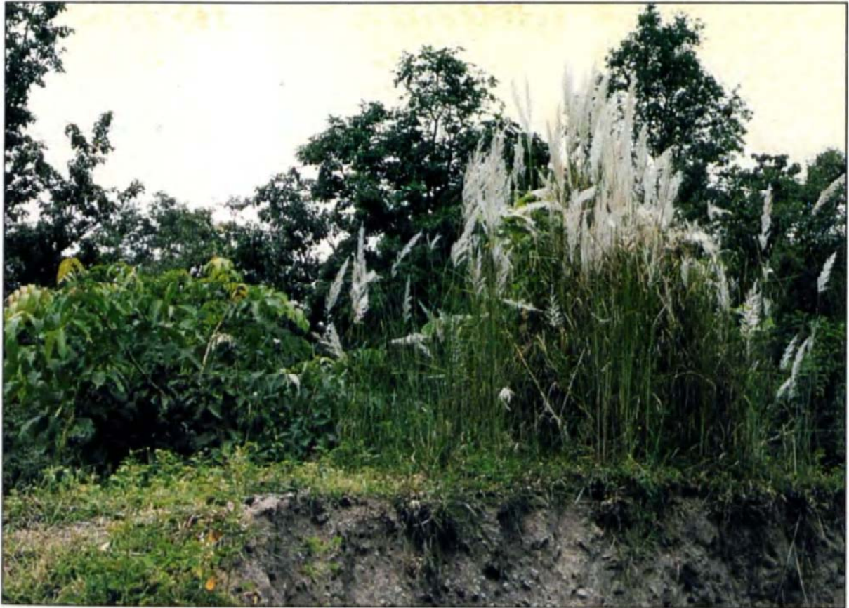
Saccharum spontaneum L.