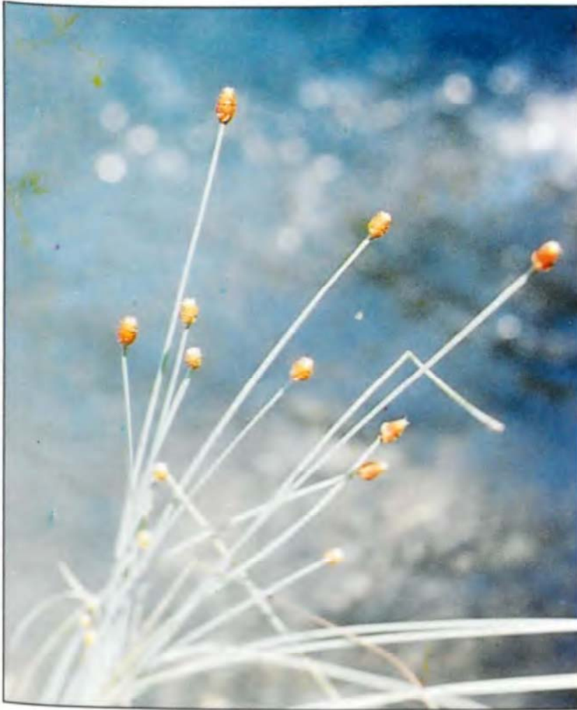
Fimbristylis tetragona R. Br.