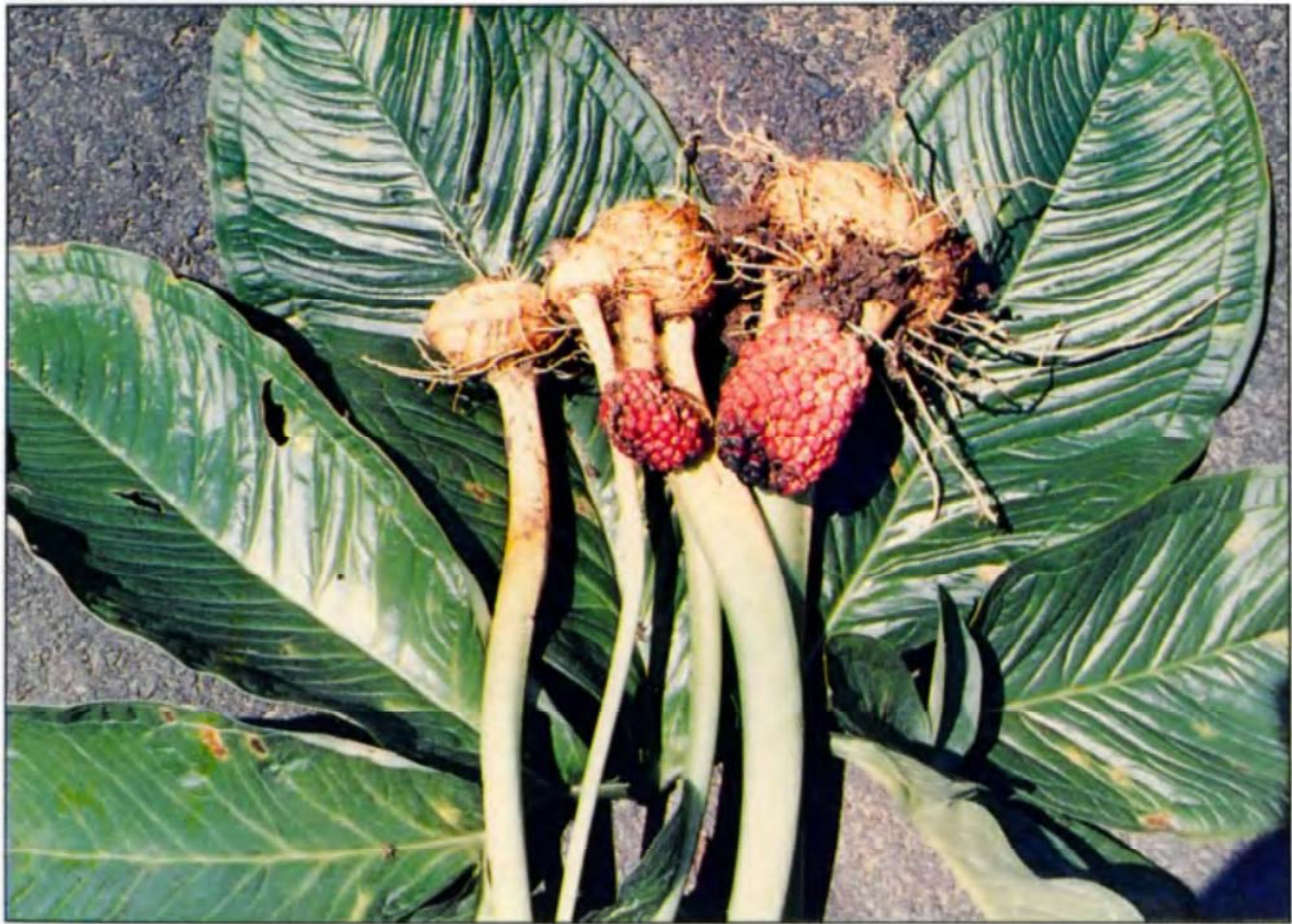
Sauromatum venosum (Ait.) Schott