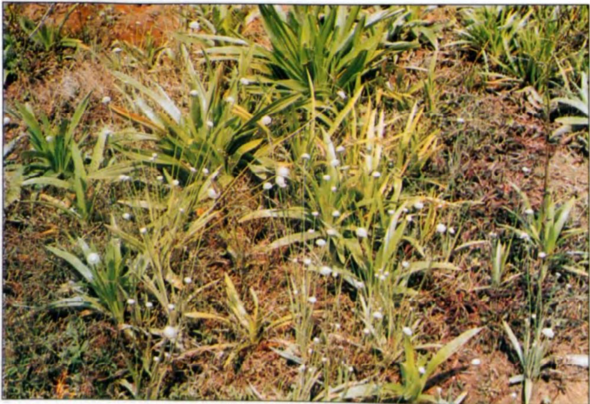
Eriocaulon robusto - brownianum Ruhl.