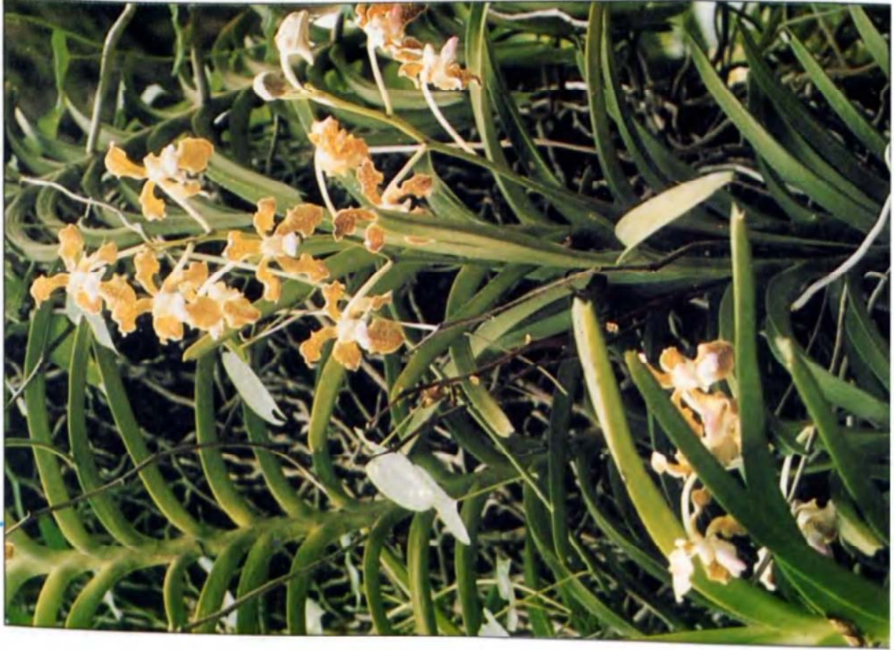
Vanda tessellata (Roxb.) Hook. ex G. Don