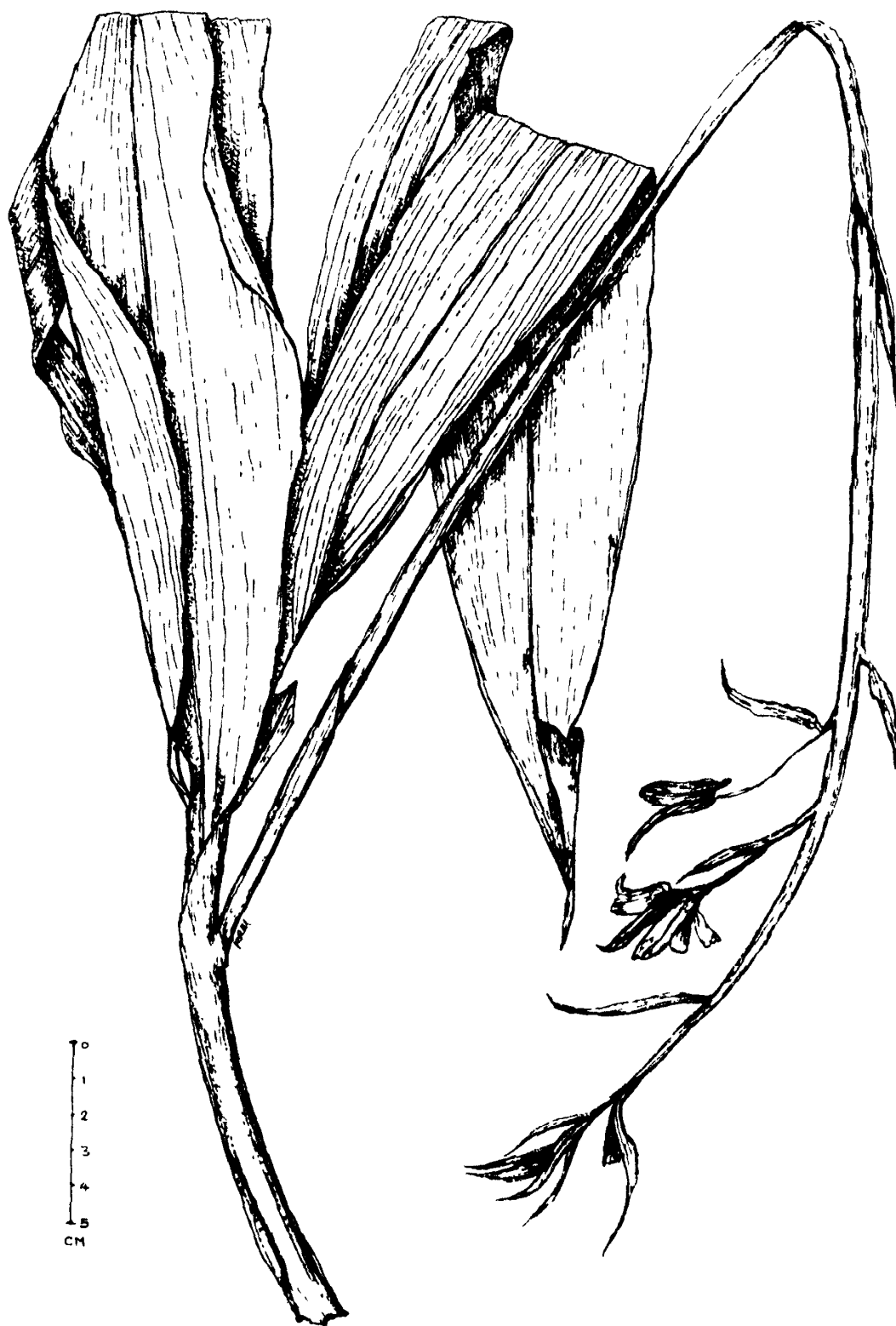
Eulophia herbsacea Lindl.