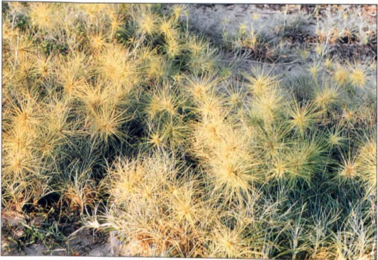
Spinifex littoreus (Burm. f.) Merr.