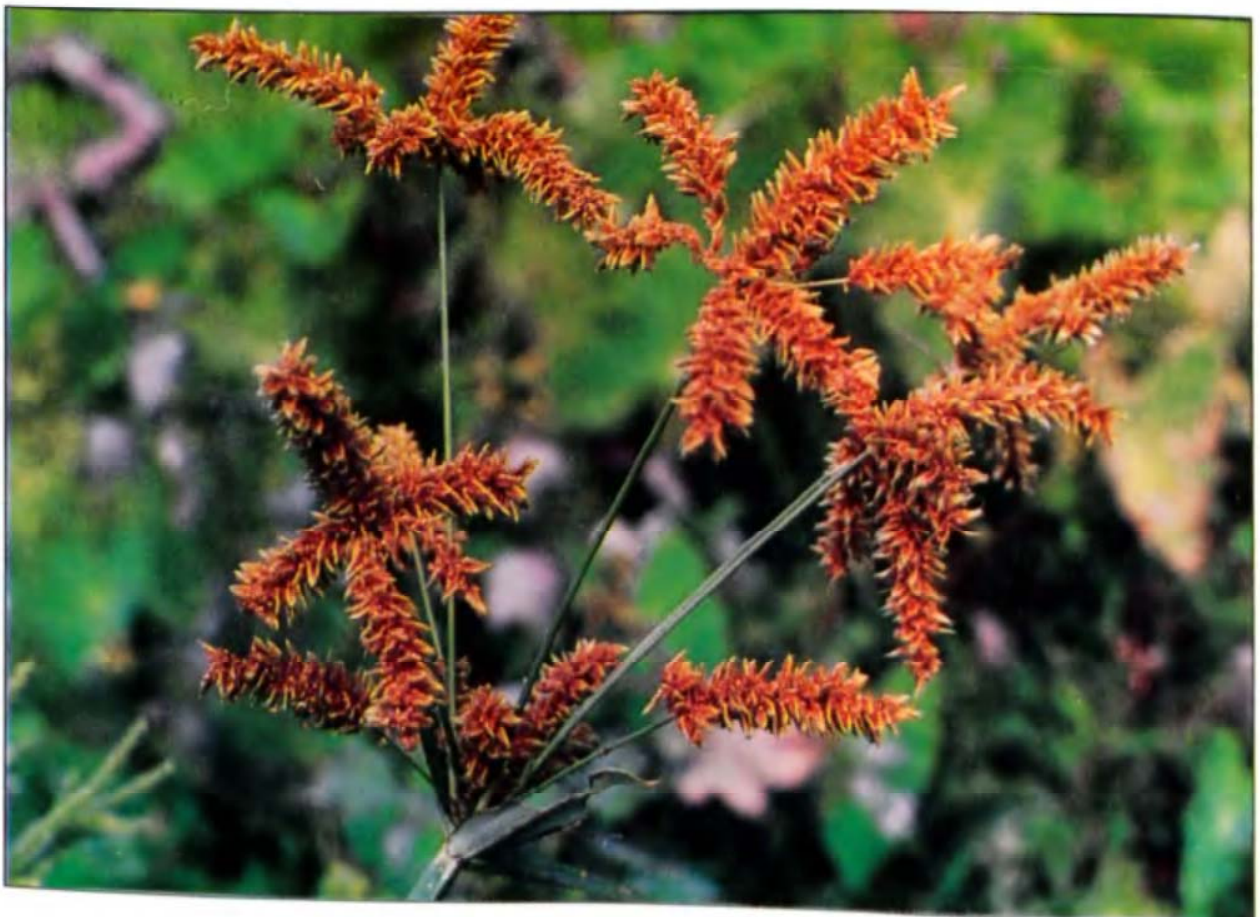
Juncellus alopecuroides (Rottb.) C.B.Cl.